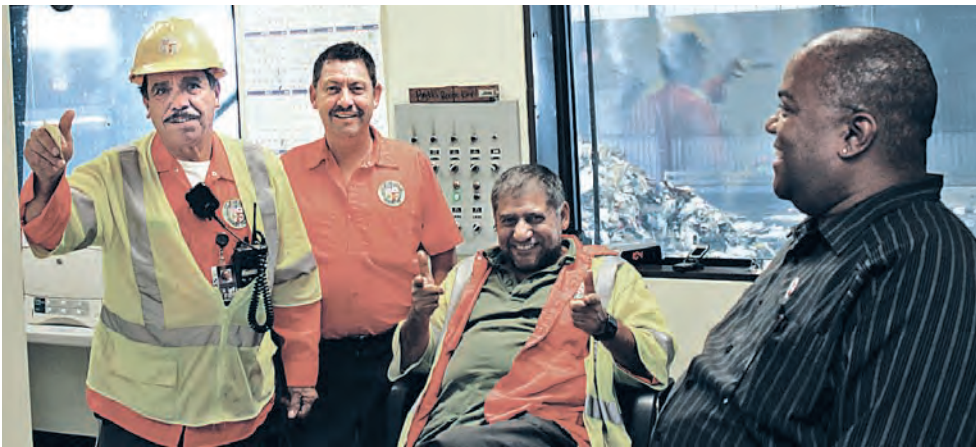
The missing group!