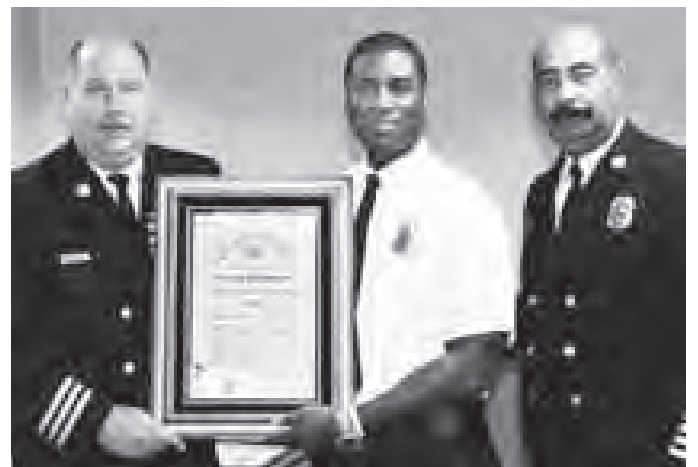
A Certificate of Appreciation was given to the firefighters of Los Angeles.