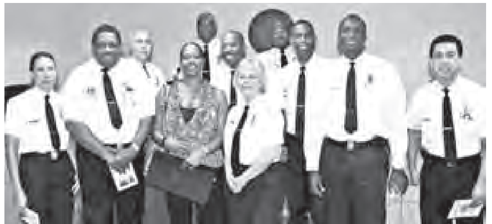
A group photo of those receiving acknowledgement from the Bureau of Fire Prevention and Public Safety.