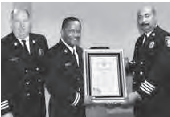
A Certificate of Appreciation was awarded to the Stentorians.