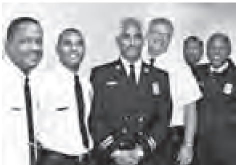
A happy crew is about to get a plate of food and join the reception area.