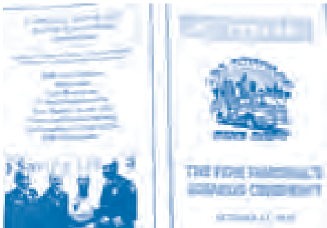
The event program.