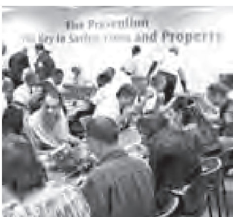
"Fire Prevention: the Key to Saving Lives and Property."