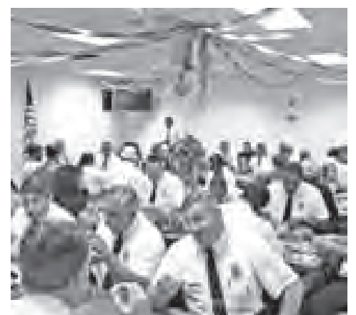
The reception area was festive and vibrant.