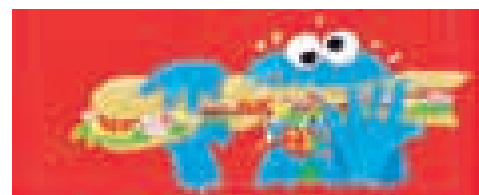
An illustration from Food! By Cookie Monster by Mike Pantuso. Produced by Random House, 2002.