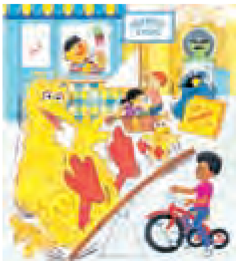
An illustration for the puzzle Sesame Street Shapes by Leon Jason Studios. Produced by Western Publishing Co., 1971.