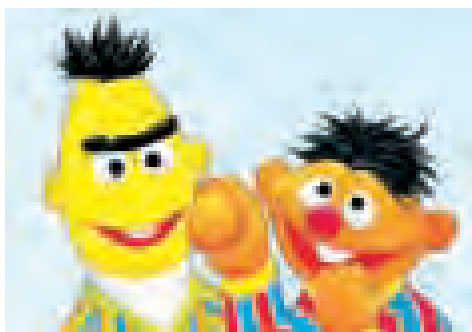
A cover illustration from Finish the Picture by Tom Brannon. Produced by Western Publishing Co., 1987.

40 years of Sesame Street are celebrated in art exhibit at Central Library through April.