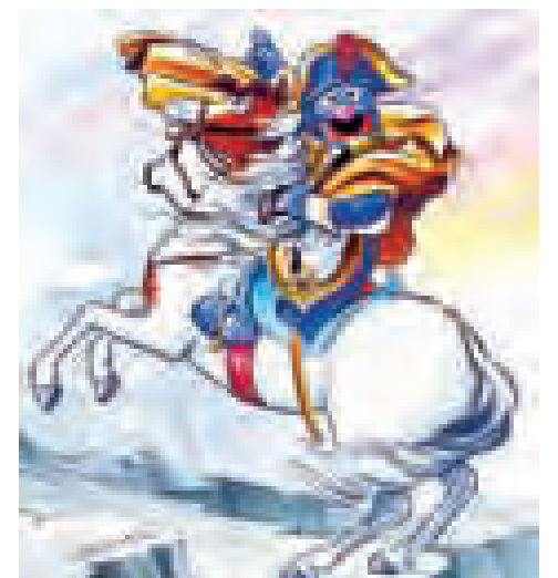
A cover illustration from Museum of Monster Art by Tom Brannon. Produced by Western Publishing Co., 1990.