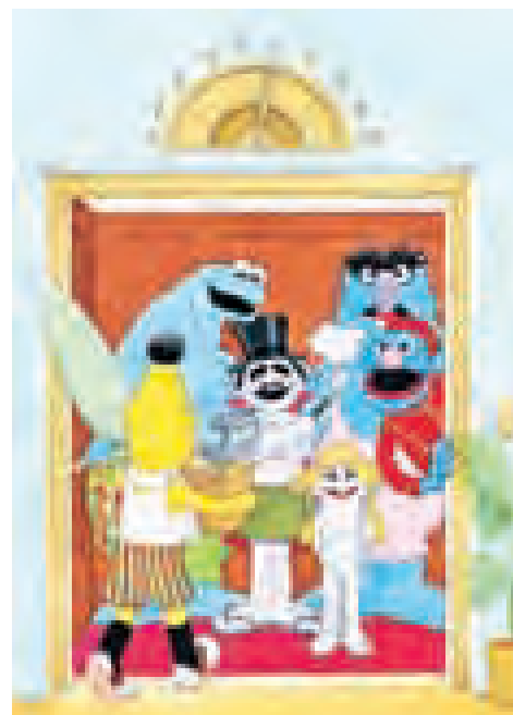
An illustration from Going Up: The Elevator Counting Book by Tom Leigh. Produced by Western Publishing Co., 1980.