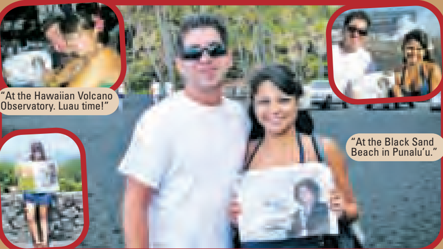
"At the Hawaiian Volcano Observatory. Luau time!"