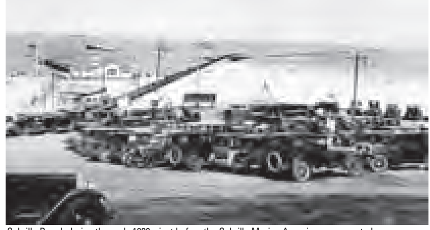
Cabrillo Beach during the early 1930s, just before the Cabrillo Marine Aquarium was created.

The richness and diversity of the sea, combined with fun-in-the-sun games, hometown spirit and entertaining events to commemorate this special anniversary, can all be found at this year's "Autumn Sea Fair."