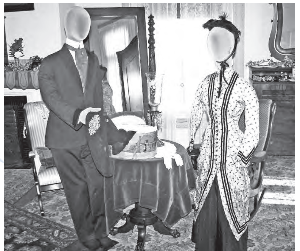
Part of the exhibition celebrating the birthday of Phineas Banning.