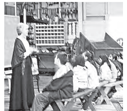
A Banning volunteer gives a lecture to students.

Tours run Tuesdays through Thursdays, at 12:30, 1:30 and 2:30 p.m., with an additional tour Saturdays and Sundays at 3:30 p.m. Admission is $5 for adults and $1 for children under 12. The museum is at 401 East M Street, Wilmington, CA 90744. For more information, call (310) 548-7777 or go to www.thebanningmuseum.org .