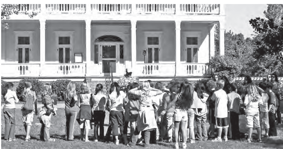
Volunteers provide a number of important services at the Banning Museum.