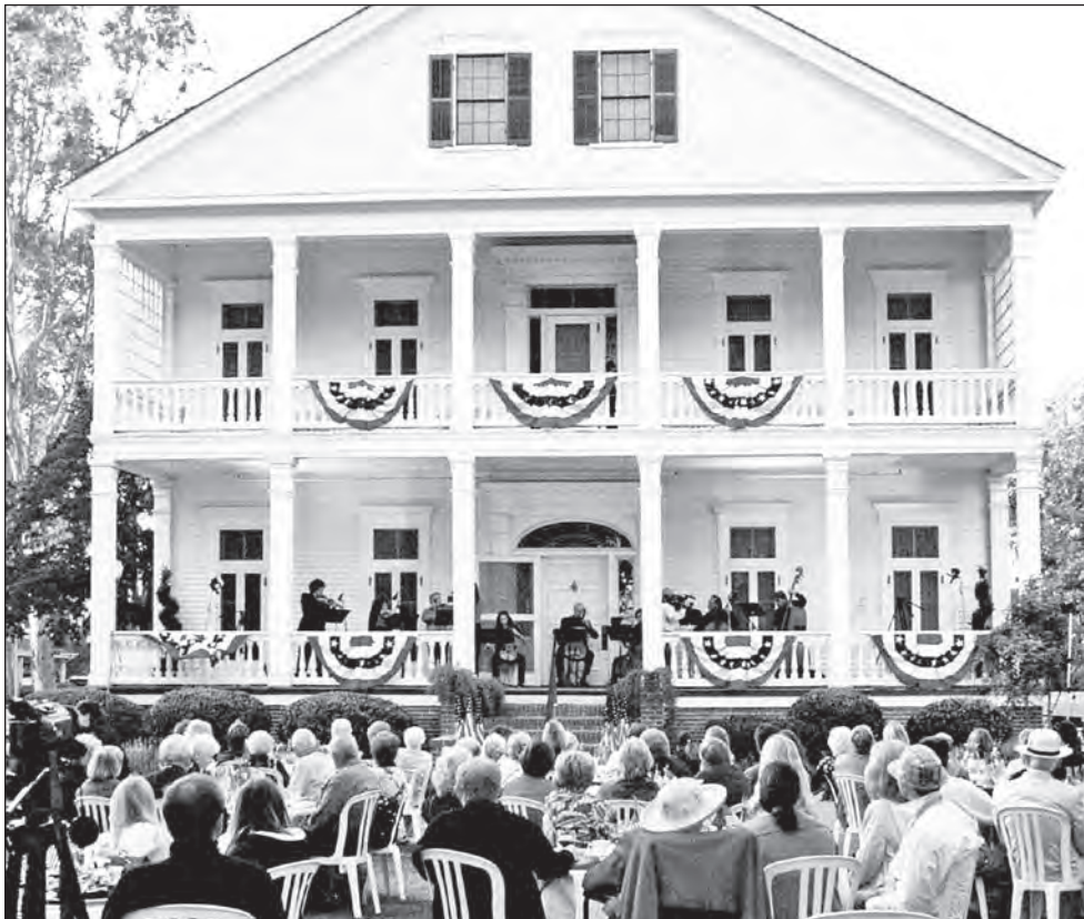
A previous Concert in the Park.