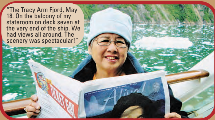
"The Tracy Arm Fjord, May 18. On the balcony of my stateroom on deck seven at the very end of the ship. We had views all around. The scenery was spectacular!"