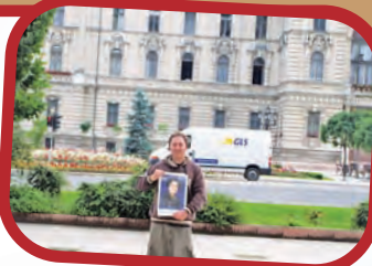
"Recently I had the pleasure to revisit my beloved homeland, Hungary. I greatly enjoyed my stay with family and friends. This is in front of the Gyor City Hall in northwest Hungary. The last picture is 'with' the Ticket Gal, She 'came' to Hungary, too!"