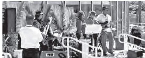
The band consisted of several harbor department employees.