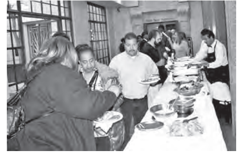
The food line.