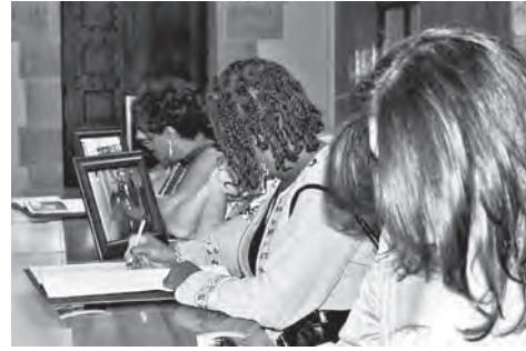
Signing the guestbook.