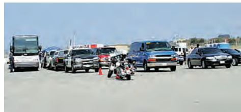
The LAX limousine holding lot with commercial vehicles under inspection.

Two drivers were issued Personal Service Citations for alleged misdemeanor violations. Another 48 drivers were cited for alleged administrative violations, including serious mechanical problems, improper insurance, driving with an out-of-class license, and invalid or no PUC permits. Fines for these citations vary, and the drivers must show proof of correction before they can resume for-hire operation.