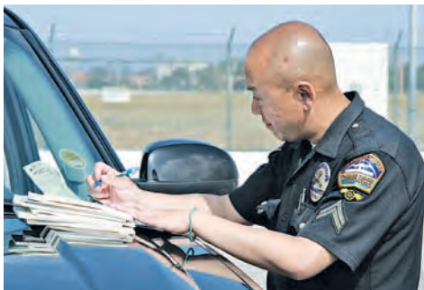
Airport Police CEU Officer Pan issues an administrative citation for alleged non-compliance.