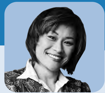
BY TIFFANY SY The Club's Peace of Mind Expert

Contact me at info@cityemployeesclub.com