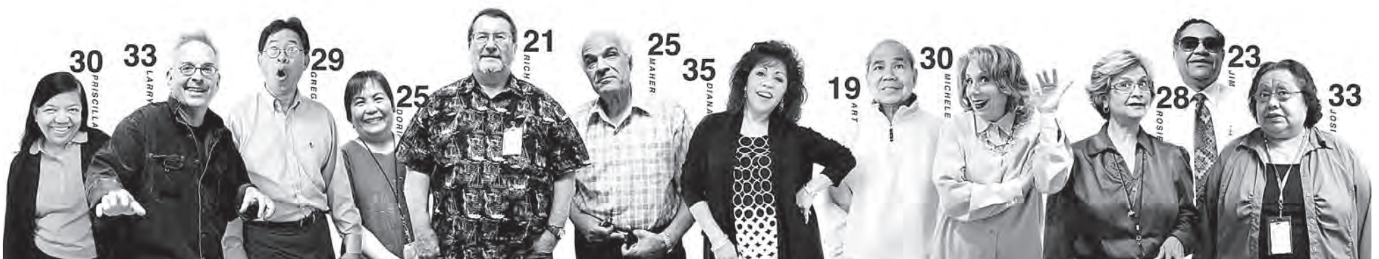
The 12 retiring from Community Development.