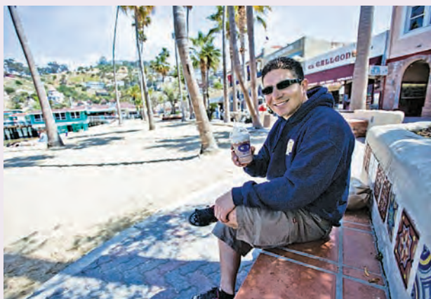
After a day of really hard work, an iced, blended drink hits the spot.