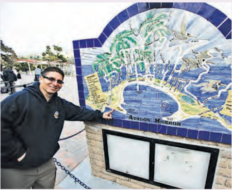
Catalina Island Avalon Harbor plaque. We're in Avalon!