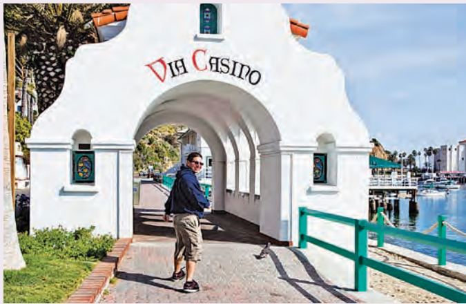
Passing the casino to the zip line starting point.