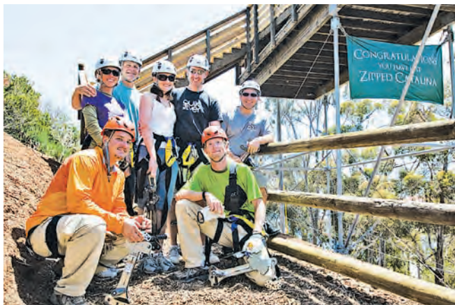
After the zip line, here are our tour guides and other zip liners.