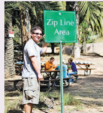
The zip line area.