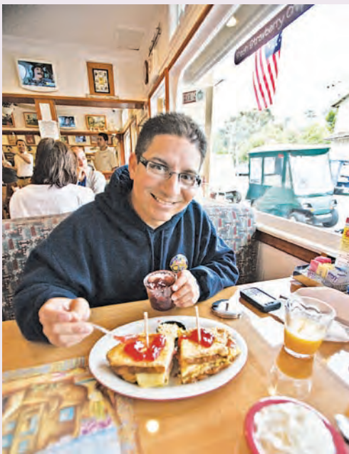
I'm enjoying my Monte Cristo sandwich at the Original Jack's next to Vons Express.