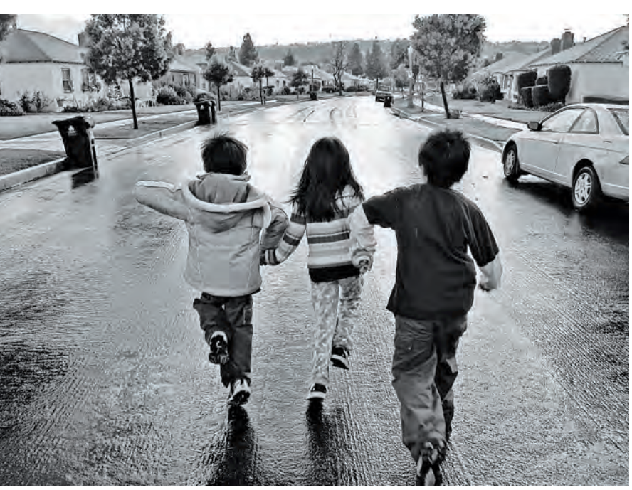
"My son and his cousins enjoy the first few raindrops of the year (December 2009). The excitement fizzled quickly after a few months of recurring downpours in Los Angeles. Kids get bored almost as quickly as they get distracted. The picture was taken in native black and white with the Canon S90."