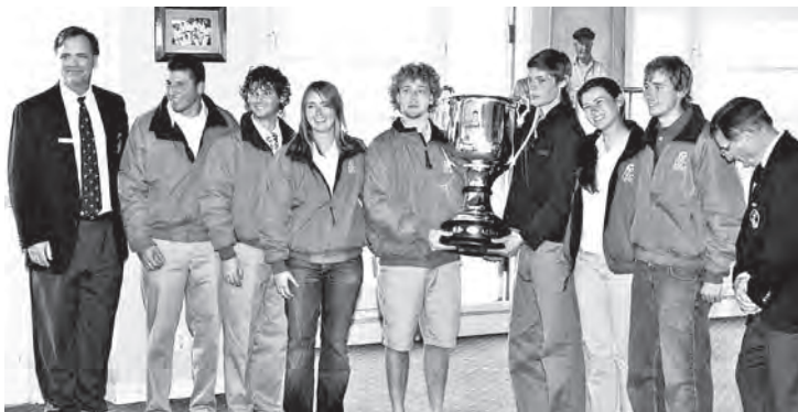
USC's sailing team won the Harbor Cup regatta.

The participating sailing crews and supporters had a terrific time during this close-to-the-wire regatta competition. Everyone is looking forward with great gusto and excitement to participating in next year's 2011 Harbor Challenge Cup!