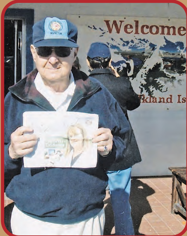
"Here is a picture of the 'Invasion of the Falkland Islands' by the City of Los Angeles. It was taken during a trip around South America this spring."