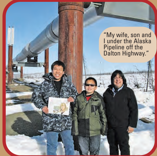
"My wife, son and I under the Alaska Pipeline off the Dalton Highway."