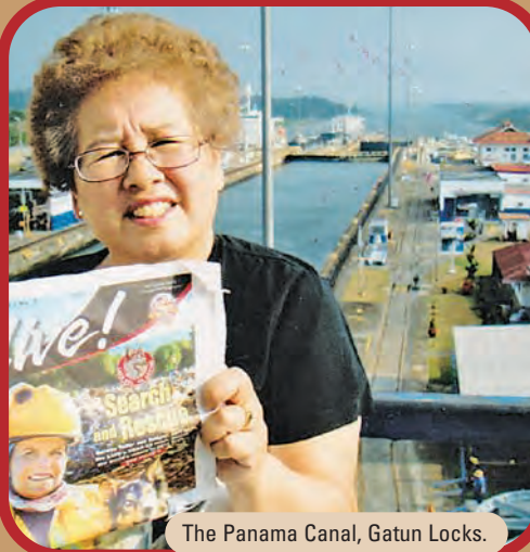
The Panama Canal, Gatun Locks.