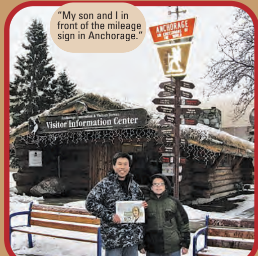
"My son and I in front of the mileage sign in Anchorage."