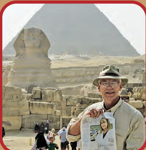
"The Pyramids are the greatest engineering feat of all time, before computers, before calculators, before slide rules, 2,600 years before Jesus Christ, and before my size 13 feet."

"Here I am with the Great Pyramid and the Sphinx."