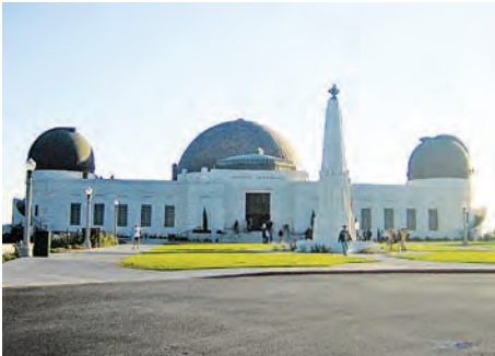
The Griffith Observatory.

Griffith Observatory was featured in an all-new season of TLC's "Ultimate Cake Off" March 1. The hour-long special episode titled "Griffith Observatory" celebrated the renowned