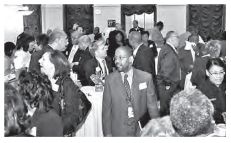
At the reception.