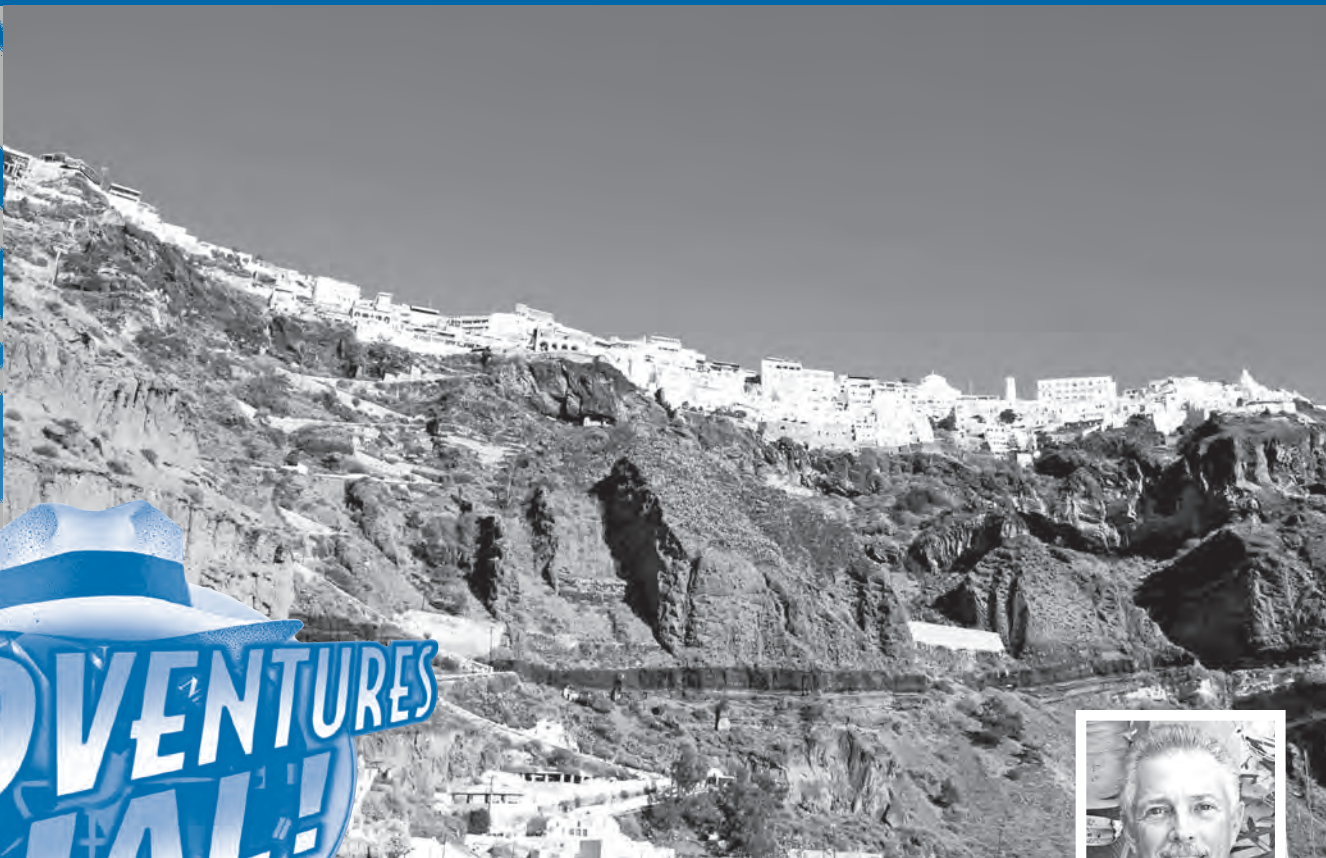
Santorini from sea level.