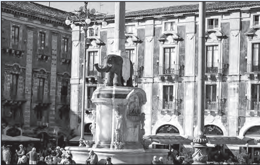
The central square in Catania.

21 more days to go, so I'm sure we will have both good and bad talent.