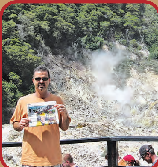
St. Lucia, U.S. Virgin Islands: Standing inside of the only drive-through volcano, in St. Lucia.