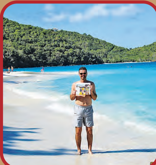
St John, U.S. Virgin Islands: On the beach at Trunk Bay in St. John.