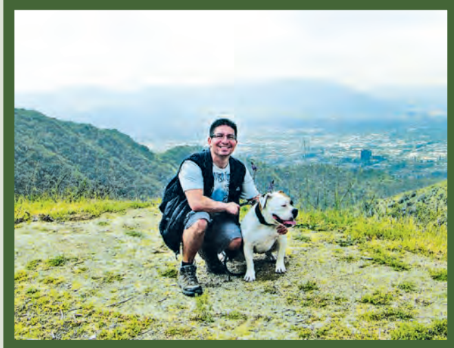
We made it half way up the trail, with Burbank in the background.

Send me your pictures! If you go, I would love to see your pictures! Send them to me at agomez@cityemployeesclub.com