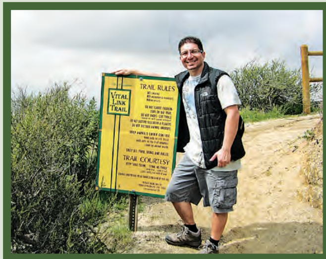
Sign with Trail Rules