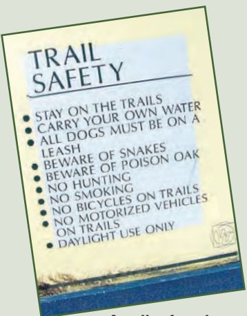
A trail safety sign.