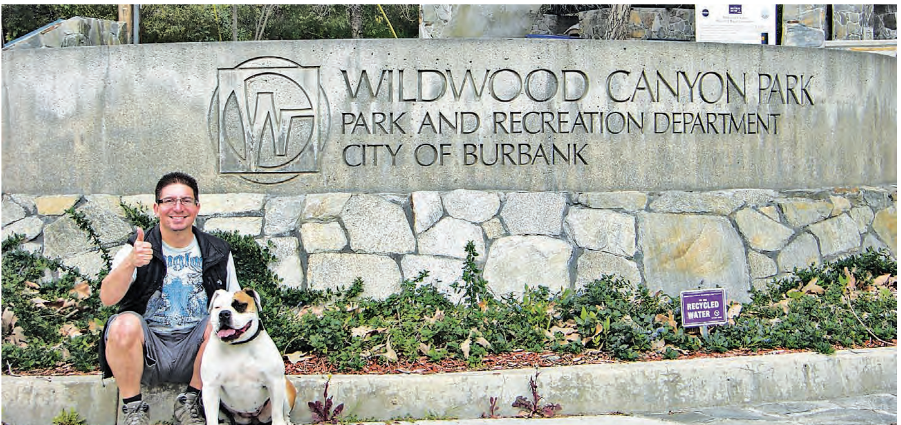
Dakota and I at the entrance to Wildwood Park.

DIFFICULTY: Hikes of various difficulties and distances are possible at Wildwood.