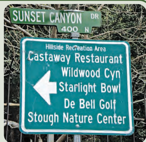
Hillside Recreation Area Sign

Wildwood Canyon Park, 1701 Wildwood Canyon Drive, Burbank, CA 91501 PHONE: (818) 238-5440