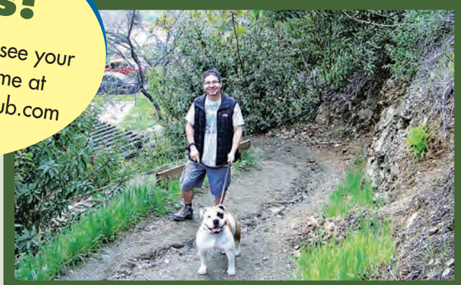
Dakota and I start our climb up the first trail nearest to the entrance.