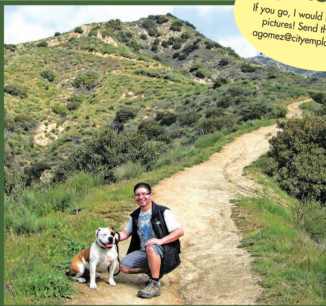
Dakota and I take a short break.

Send me your pictures! If you go, I would love to see your pictures! Send them to me at agomez@cityemployeesclub.com