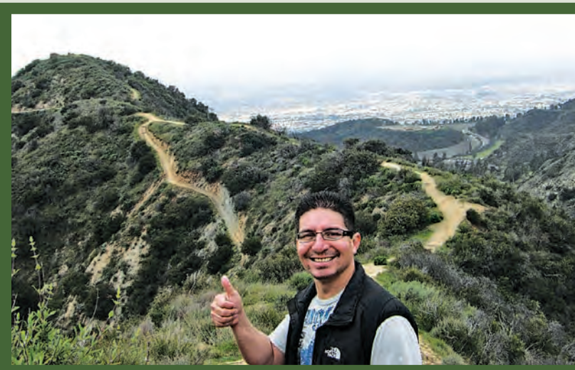
Looking back the way I came, you can see there are many trails.