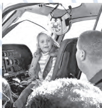
"Why yes, I'm sure I can go it alone, thank you!"