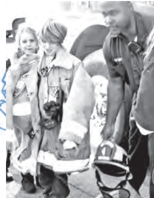
A perfect fit!