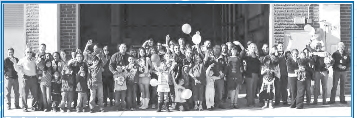
The welcoming committee cheers Santa as he lands atop LAPD's heliport at Piper Tech.