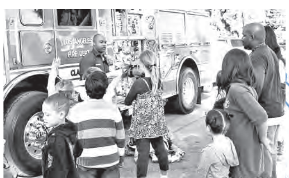
"Who's gonna be a fireman when they grow up?"