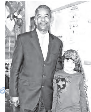
The long and short of it!

See these photos and more, in color, at cityemployeesclub.com on the Web! Click on Photos at the top of Club home page.