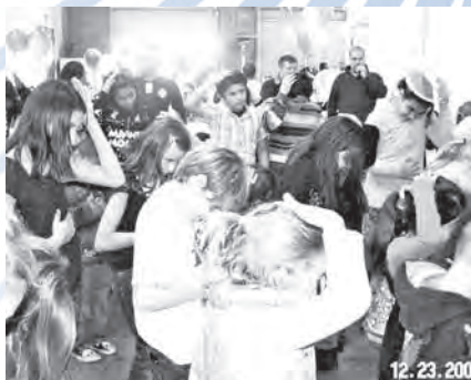
Santa says, "Rub your head."