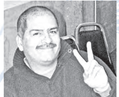
"Peace be with you."