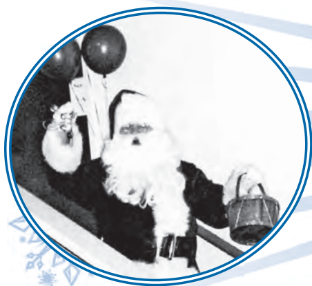
"Here comes Santa!"