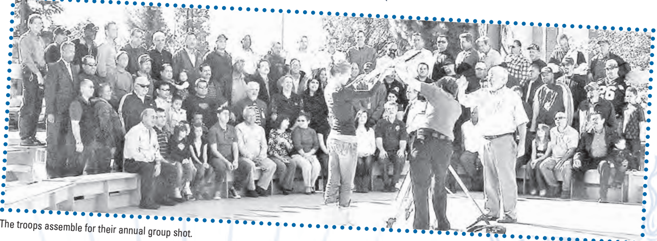
The troops assemble for their annual group shot.