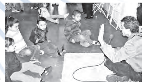
"Now raise your hand if you want a present."