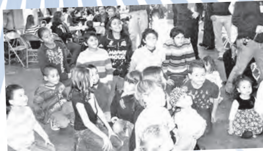
A captive audience.