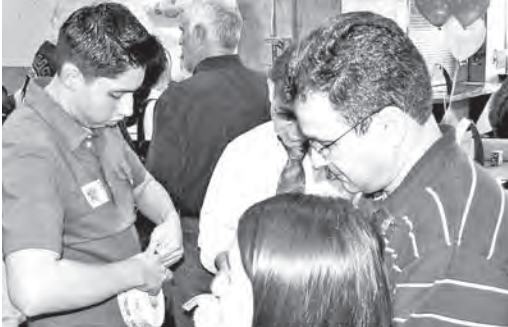
"Get your raffle tickets here!"