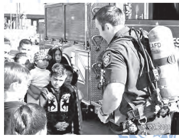
"Scuba diving, anyone?"