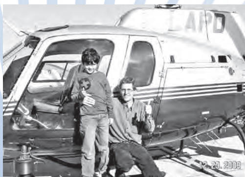
Hitching a ride to the North Pole?