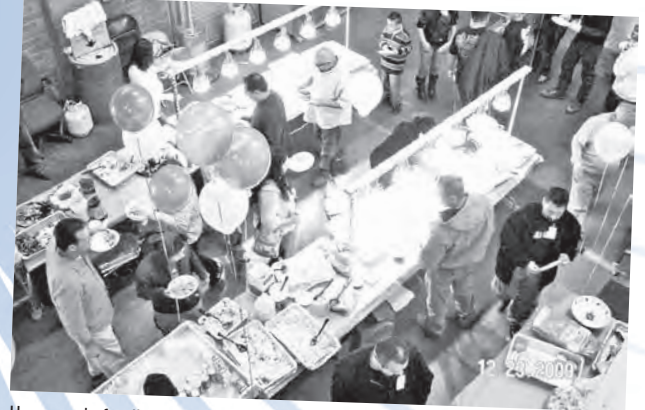
Homemade family recipes from the world over!