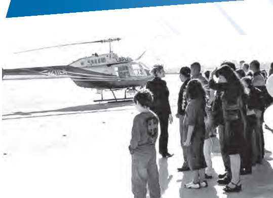
Santa's welcoming committee as he arrives in Los Angeles, a long way from the North Pole!