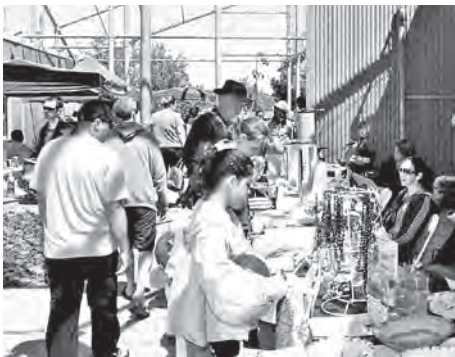
A previous Earth Day at Cabrillo Marine Aquarium.

When: Saturday, April 17 Time: 8 a.m. to 5 p.m. Where: Cabrillo Marine Aquarium, 3720 Stephen M. White Dr. San Pedro. What: Beach cleanup, free aquarium admission, grunion hatching, food, music, booths, activities, representatives of more than 40 organizations. Cost: Free; some attractions might have minimal cost. Parking: Free parking at 22nd and Miner Streets, with Red Car access. Limited car parking at Cabrillo, $1. Info: www.cabrilloaq.org , or (310) 548-7562.