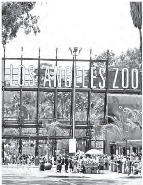
A previous Earth Day at The Los Angeles Zoo.

The Los Angeles Zoo and K-EARTH 101’s Earth Day Expo 2010, themed Celebrating California Wildlife, features education, conservation and recycling information in an interactive and fun Earth-friendly environment. The two-day event includes a bevy of information booths, fun crafts and the opportunity to meet K-EARTH DJs. The event takes place from 10 a.m. to 4 p.m. Saturday and Sunday, April 17 and 18. The Los Angeles Zoo and Botanical Gardens is at 5333 Zoo Dr. in Griffith Park. Information: (323) 644-4200 or www.lazoo.org