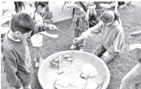
A previous Earth Day at Cabrillo Marine Aquarium.