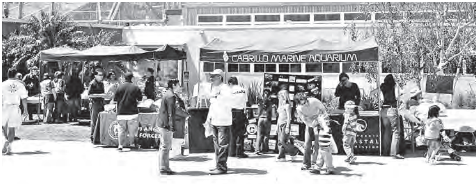
A previous Earth Day at Cabrillo Marine Aquarium.

make a difference in protecting our planet. Throughout the day, the Aquarium will be open with opportunities to examine Southern California marine life, where you can visit the touch tank; search the Virginia Reid Moore Marine Research Library for more information about local sea life; observe the aquarium’s newest arrivals in the Aquatic Nursery; and investigate the interactive Exploration Center. Free parking is available at 22nd and Miner Streets with access to a shuttle in each direction. Guests can also connect to the shuttle from the Marina station of the Pacific Red Car Line along the Port Waterfront. Red Car info: www.railwaypreservation.com/page8.html . Limited car parking at Cabrillo Beach is $1 per hour. Cabrillo Marine Aquarium is at 3720 Stephen M. White Dr. in San Pedro, and is a Rec and Parks facility. For more information, call (310) 548-7562 or go to: www.cabrilloaq.org