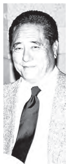
Former Mayor of the City of Carson Mike Mitoma.