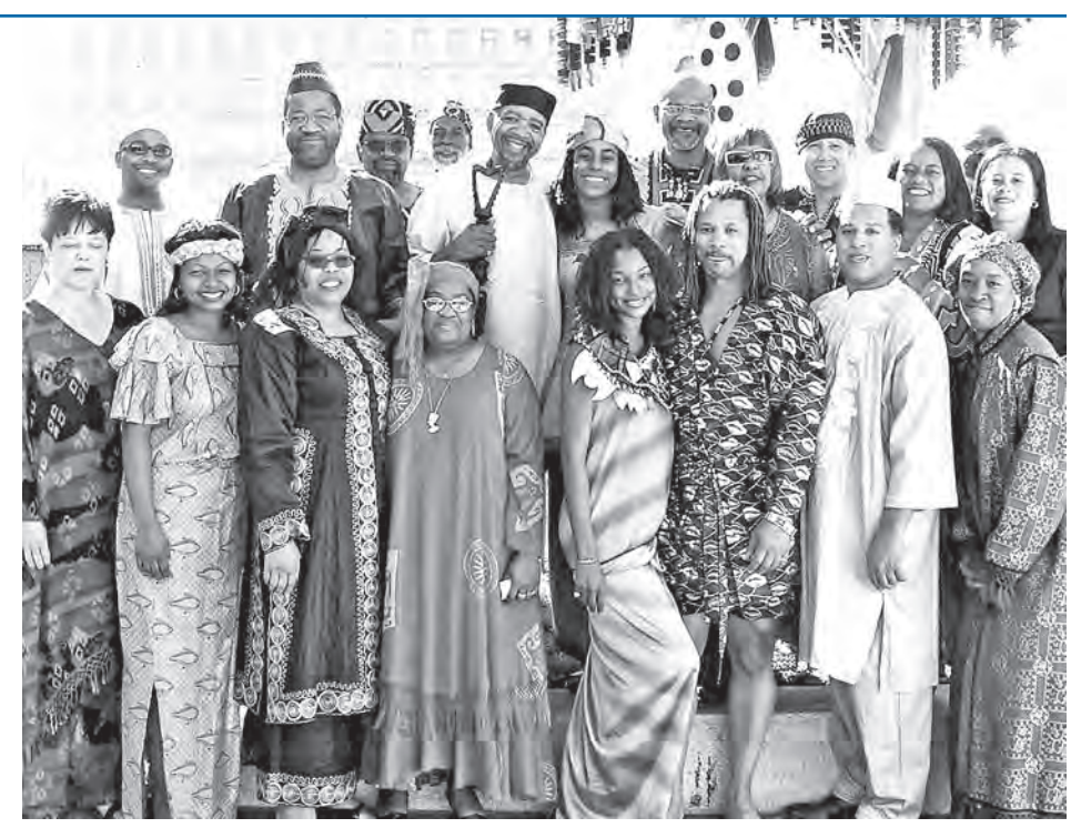
Last year, the annual Fashion Show at the African Marketplace featured many City workers as models.

Afrocentric Fashion Show on the second day. The event, scheduled for 10 a.m. to 2 p.m. Feb. 23 and 24 at Fletcher Bowron Square downtown, will feature music, food, art, crafts and more. Free. Sponsored by the Los Angeles Association of Black Personnel (LAABP). Visit www.laabp.org or call