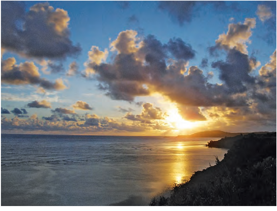
"Unfortunately, I was unable to be at the birth of my first granddaughter; however, this sunrise picture was taken in Kauai, Hawaii, around the time she was being born. It's a small peek at the heavenly light (representing her birth), captured through the clouds and reflecting off the water (representing my daughter). Many pictures were taken on this trip; however, this one remains one of my favorites."