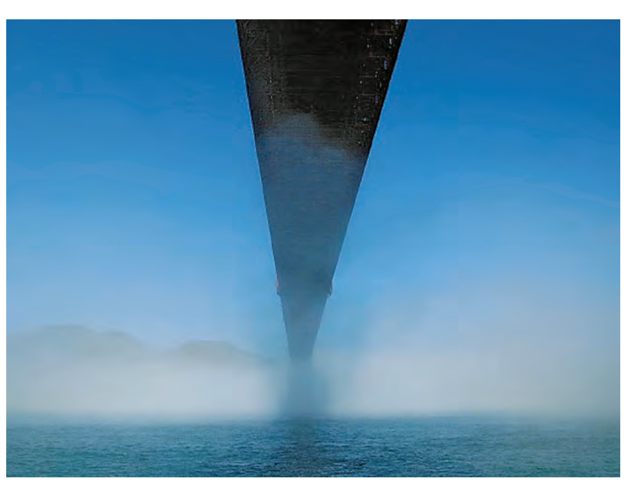
"Through the fog, at the Golden Gate Bridge."