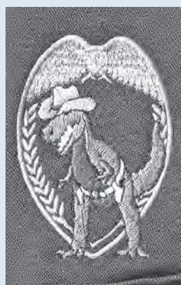
The Dinosaurus logo.

"The LAFCU Board Election and Annual Meeting will be Tuesday, Feb. 23. Many of our retirees hold office in the Credit Union, which is also a contributor to our Golf Tourney."