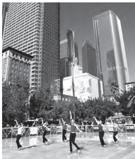
Past years at Downtown on Ice .

Square Station makes getting there easy. Underground discount parking is available with validation. For more info and a detailed session schedule go to www.laparks.org and click to Pershing Square or call (213) 847-4970.