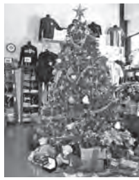
You can fill the bottom of the new Club Christmas Tree, when you donate an unwrapped toy to the Club's Toy Drive. Won't you help this great cause?

When you come down to the Club Store to pick up your refund check or to buy great Club holiday gifts, why not bring a toy to donate? We'll place it under the Club Christmas Tree, which is new this year.