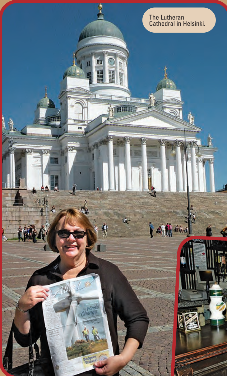
The Lutheran Cathedral in Helsinki.