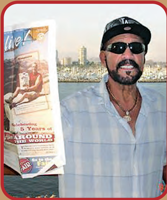
"From the deck of the Queen Mary on my birthday."