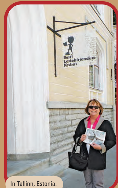
In Tallinn, Estonia.

"These photos are of my cruise to the Baltics this past June. It was the best trip abroad my husband and I have ever taken. Thank you for considering me for the Alive! Around the World Contest! "