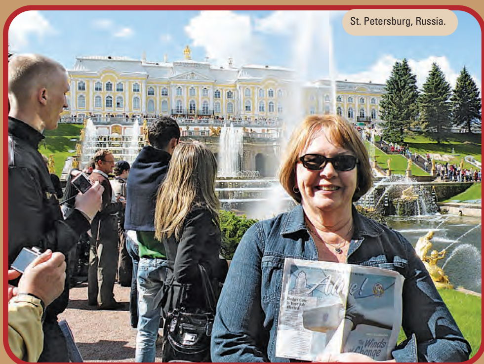
St. Petersburg, Russia.