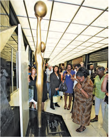
City Employee, and friends and family of the deceased look closely at the monument and its details.