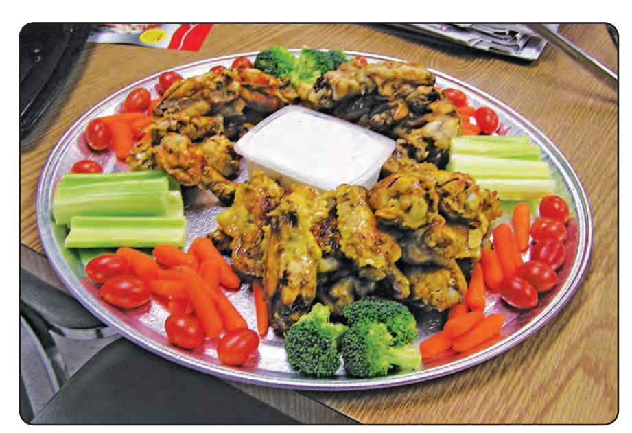
Plate your wings however you like them. I like mine with some ranch dressing and some veggies on a big party platter - ready for the game! Enjoy!

As always, please be aware of very real danger of food-borne illnesses. These can be prevented by being aware of keeping your hands and workstation surfaces clean and sanitized. You must also consider the time you cook your chicken wings along with the temperature at which they cook. Make sure they're thoroughly cooked so that bacteria on the chicken are killed from the heat.