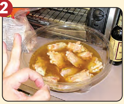
Add as many chicken wings as can be covered by the marinade. Cover with plastic or foil food wrap and leave in the refrigerator until you're ready to cook. Ideal marination should be overnight or at least three hours.