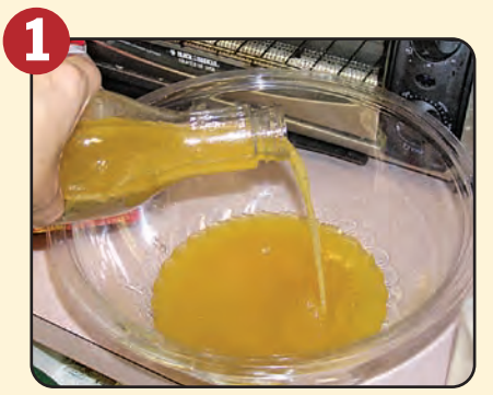
Add and mix all the marinade ingredients in a large mixing bowl.