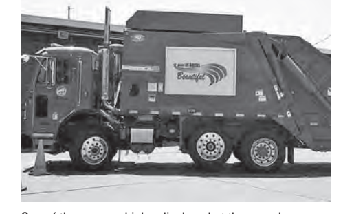
One of the many vehicles displayed at the open house.