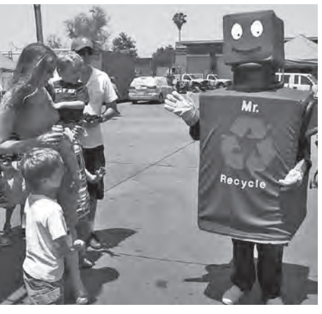
Mr. Recycle makes his appearance to the open house.