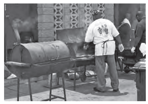
Employees cook for the community.