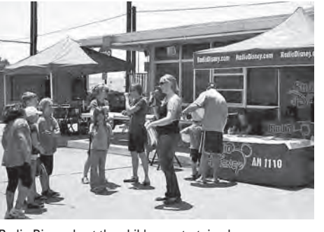
Radio Disney kept the children entertained.