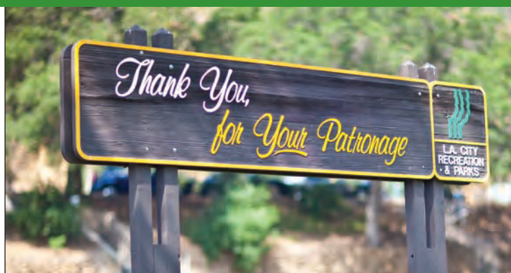
A sign at the end of the Harding course in Griffith Park.