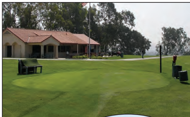
The Tregnan Golf Academy.