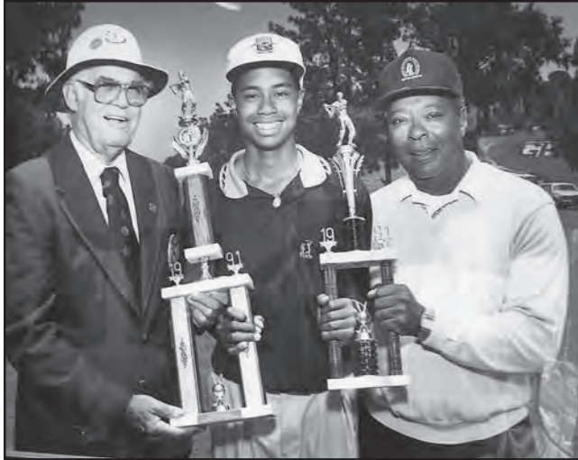
Tiger Woods won the City's Junior Boys Golf Championship in 1991.