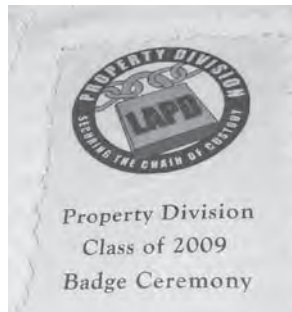
The congratulatory cake!