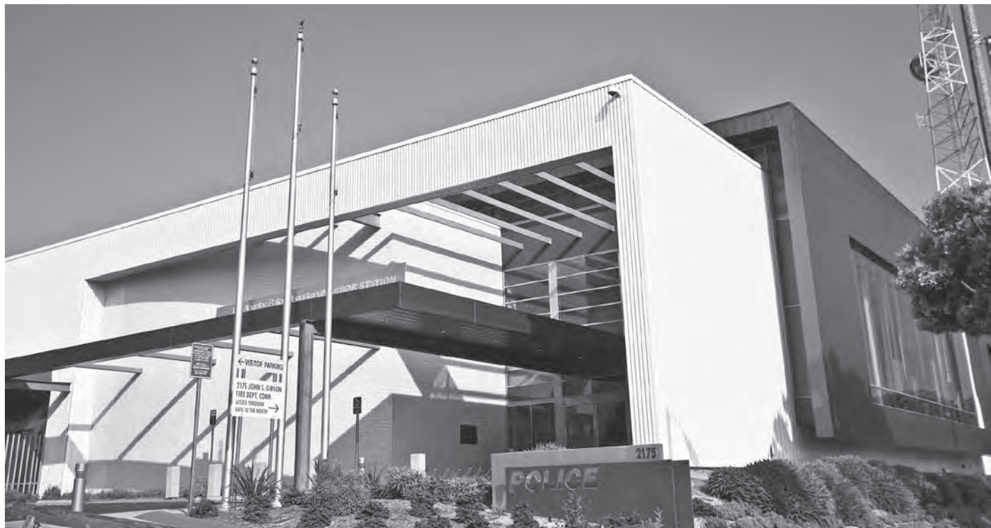
The new LAPD Harbor Station.