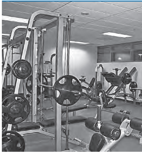
A well-equipped weight room was built, thanks through the Proposition Q budget.