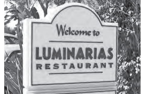
The location of the party.