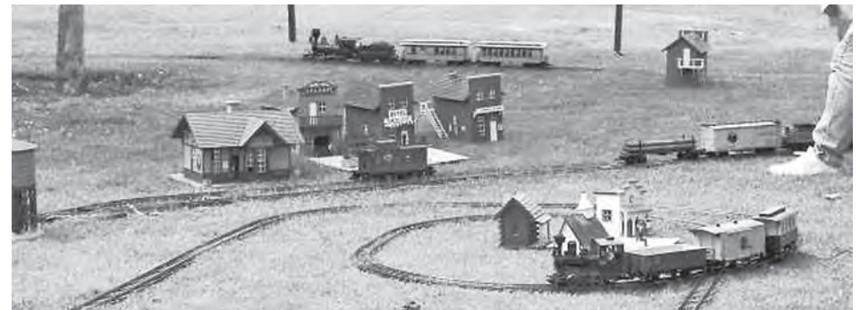
At a previous Banning Heritage Days, a model railroad always proves popular.