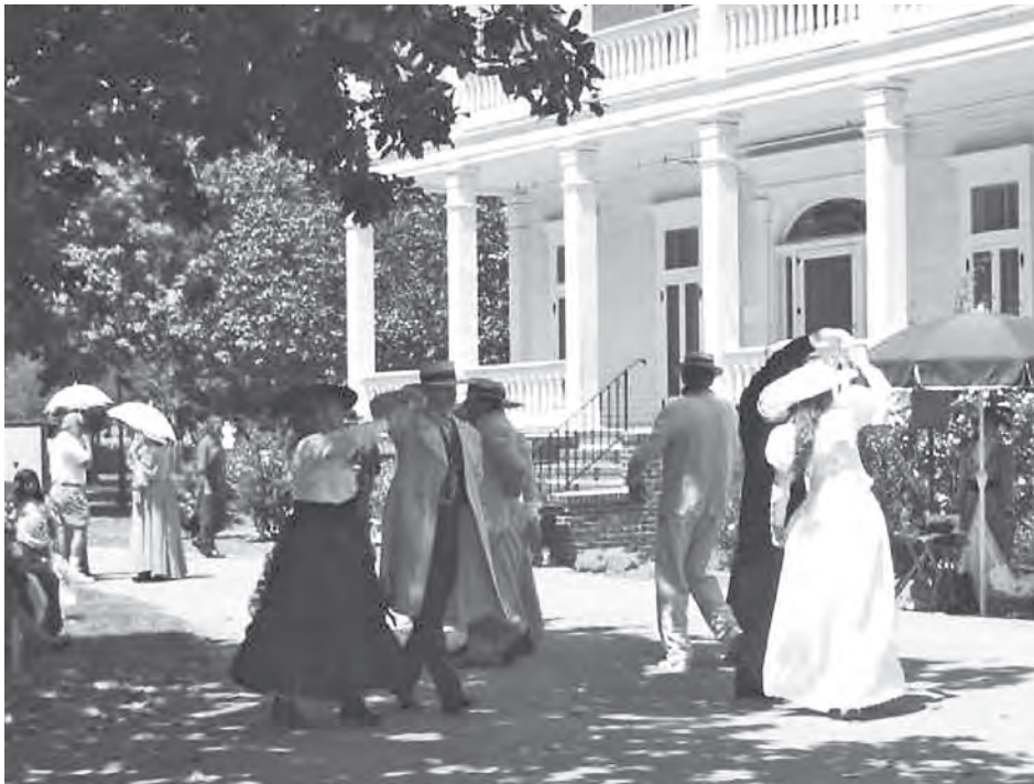
Period costumes lend a sense of history.