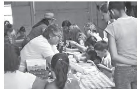
At a previous Banning Heritage Days event.