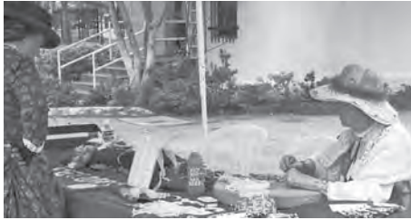
At a previous Banning Heritage Days event.

Residence Museum offers its annual heritage days June 6.