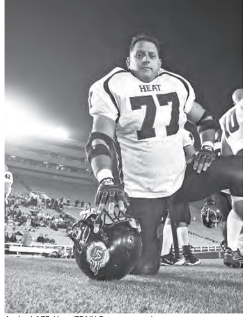
At the LAFD Heat/FDNY Bravest match

LAFD football team competes against FDNY Bravest.