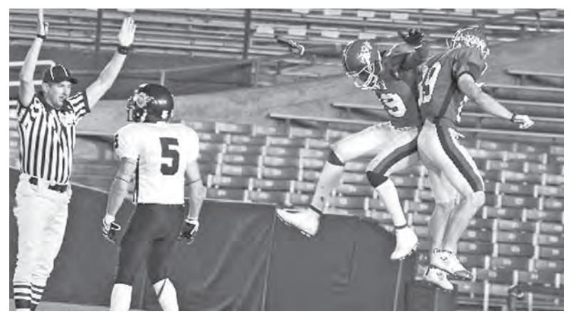
The FDNY score a touchdown, apparently.