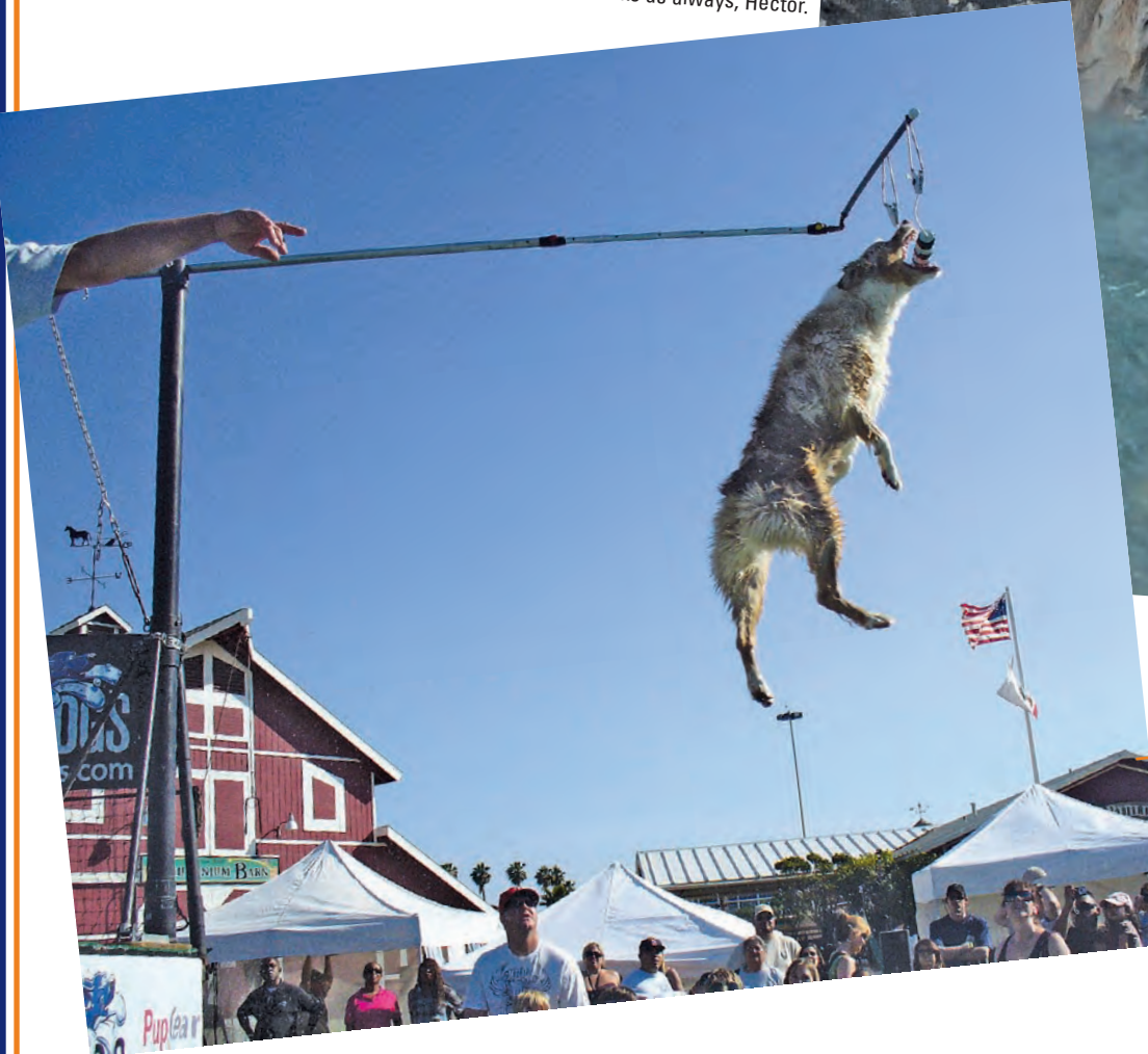
"This photo was taken at a Splash Dog competition in Orange County. Who said dogs can't fly? This will prove them wrong. My eight-month-old son enjoyed the splashing water when the doggies went into the pool. It was a great family outing."