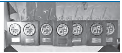
All seven "Z" awards, neatly displayed.