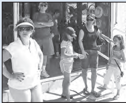
Shopping in the Golden Zone in Mazatlán.

their meal. The kids had a kid's menu, and they seemed to like the food.