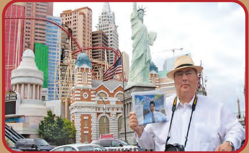
“Recently I had to go to Clark County, Nev., and I took my copy of Alive! with me.”