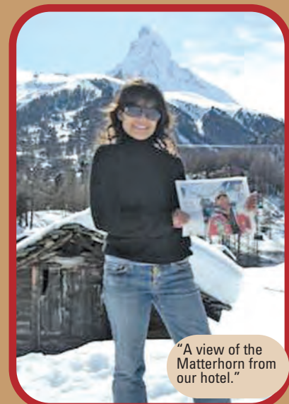
"A view of the Matterhorn from our hotel."