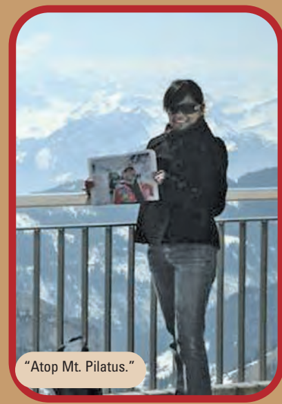
"Atop Mt. Pilatus."