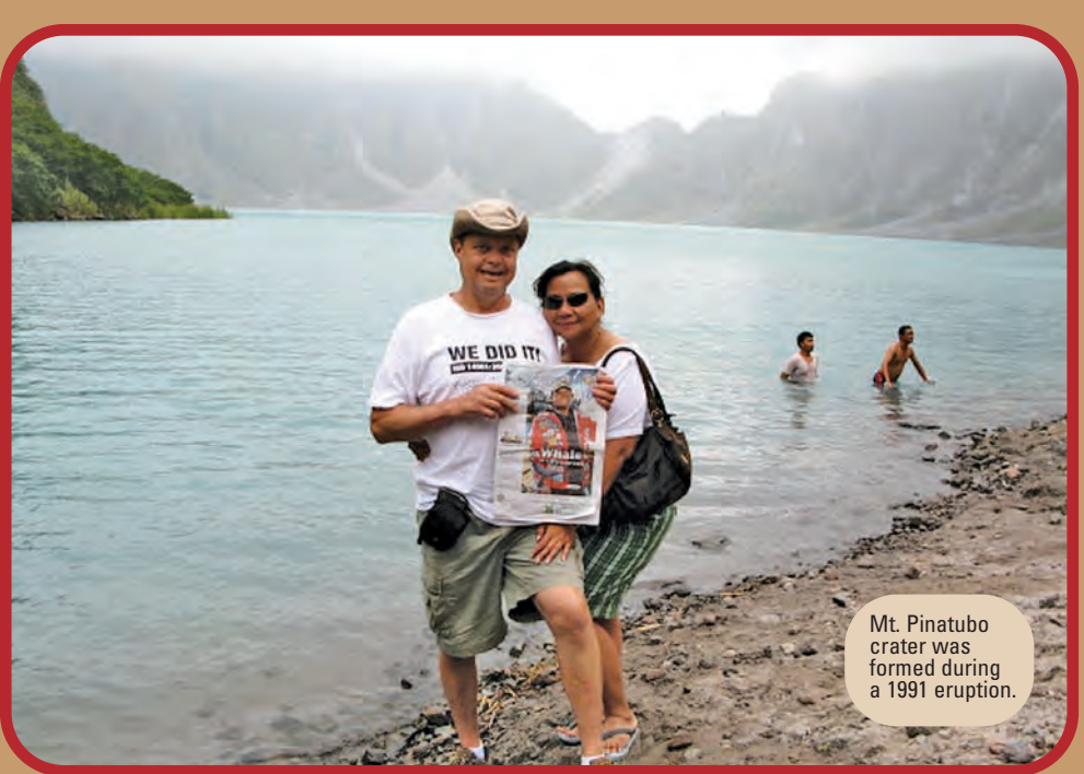
Mt. Pinatubo crater was formed during a 1991 eruption.