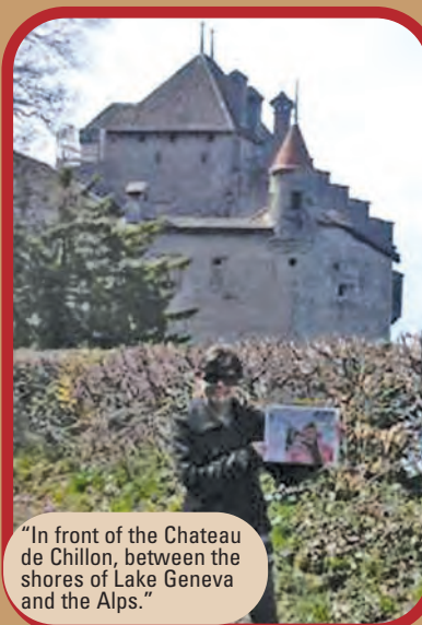
"In front of the Chateau de Chillon, between the shores of Lake Geneva and the Alps."