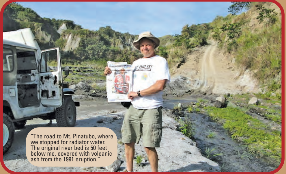
"The road to Mt. Pinatubo, where we stopped for radiator water. The original river bed is 50 feet below me, covered with volcanic ash from the 1991 eruption."