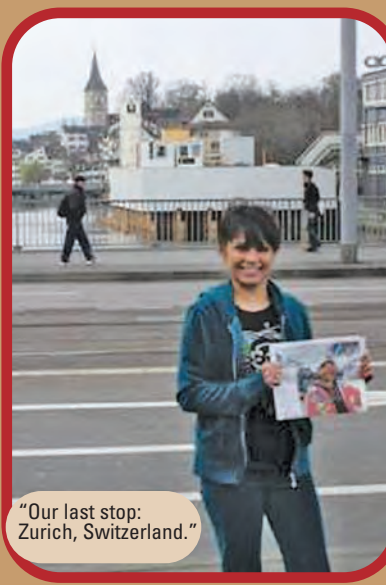
"Our last stop: Zurich, Switzerland."