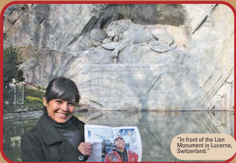
"In front of the Lion Monument in Lucerne, Switzerland."