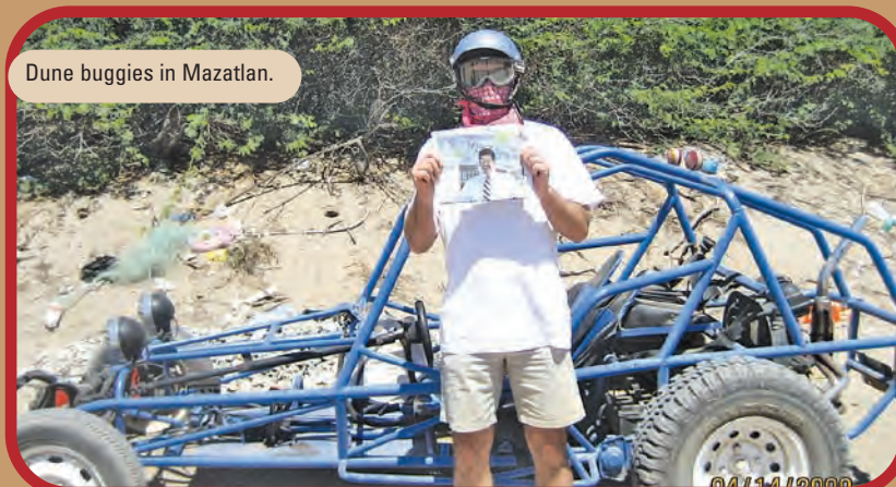
Dune buggies in Mazatlan.