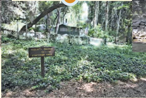
Fiddler’s Crossing and a cabin are in the background.