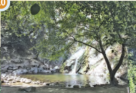
Enjoy the view.