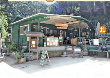
Adam’s Pack Station and General Store.