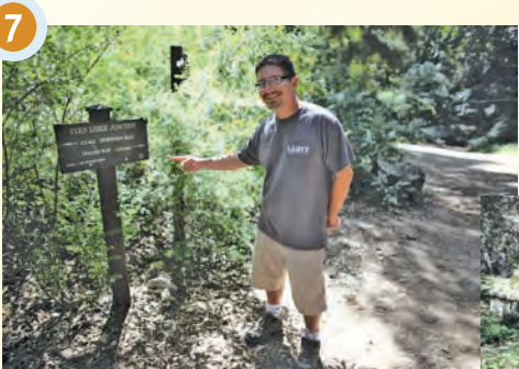
The Fern Lodge Junction sign.