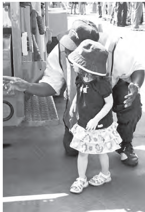
Last year, one of many children who learned to operate a compactor on a collection truck.

Attending Sanitation's open house events is a great way for kids of all ages to learn about