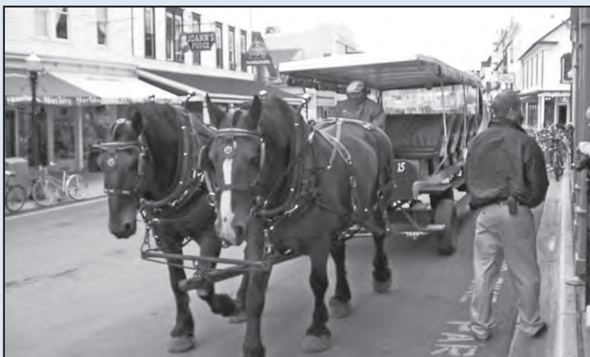
Transportation on Mackinac Island.

My best friends from high school were not there, but I did connect with a number of classmates, and it was fun being together again. I took a picture with the girl who was