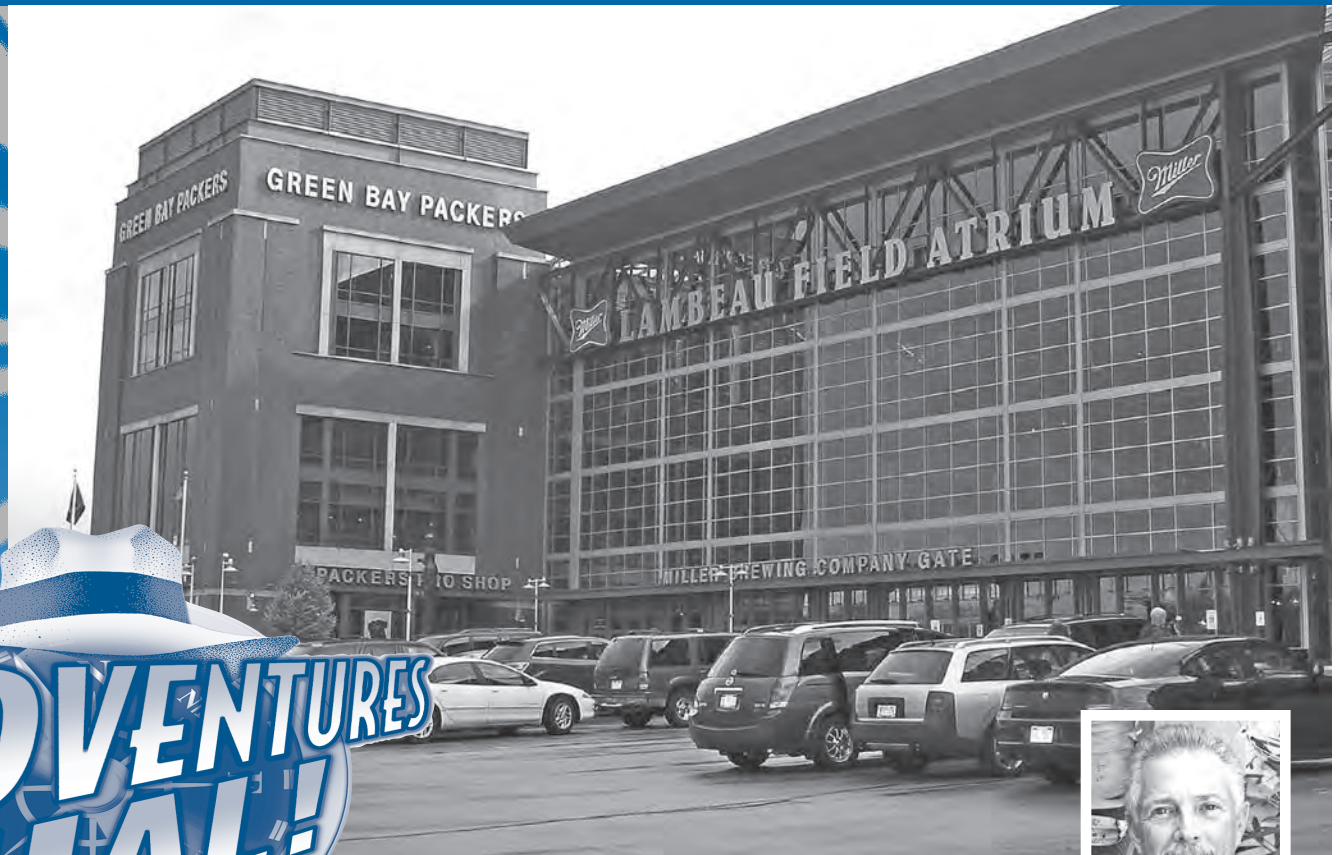
Lambeau Field in Green Bay.