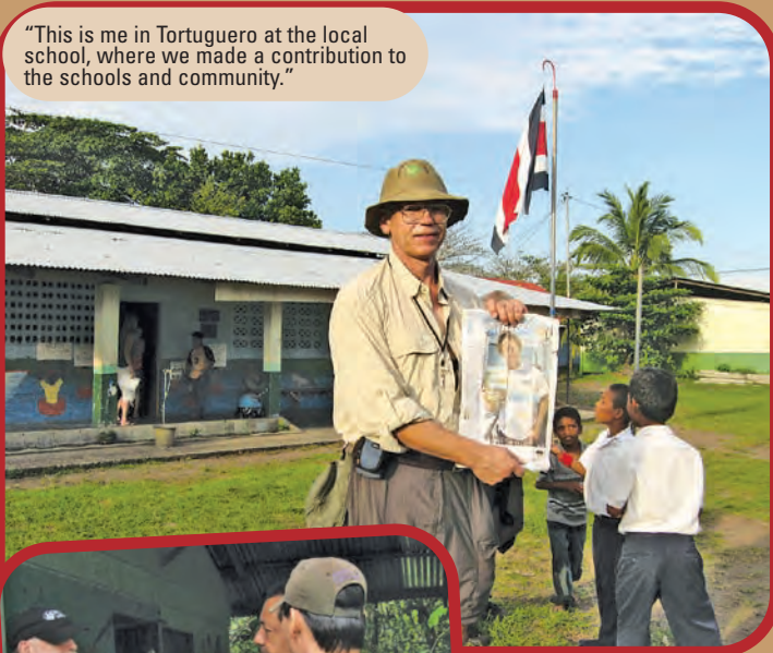
"This is me in Tortuguero at the local school, where we made a contribution to the schools and community."