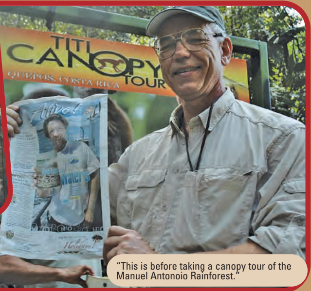
"This is before taking a canopy tour of the Manuel Antonio Rainforest."