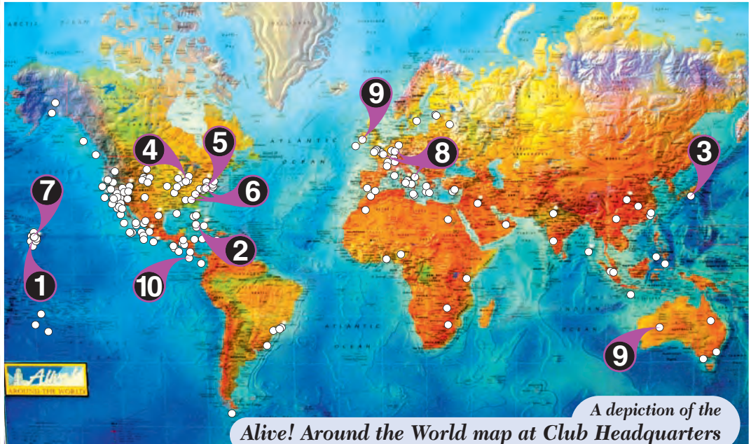
A depiction of the Alive! Around the World map at Club Headquarters

Take the Club with you, wherever you go! Club members are a well-traveled bunch. Bring your copy of Alive! with you. Snap a photo with you holding a copy, send it in, and we'll publish it. Send to: talkback@cityemployeesclub.com