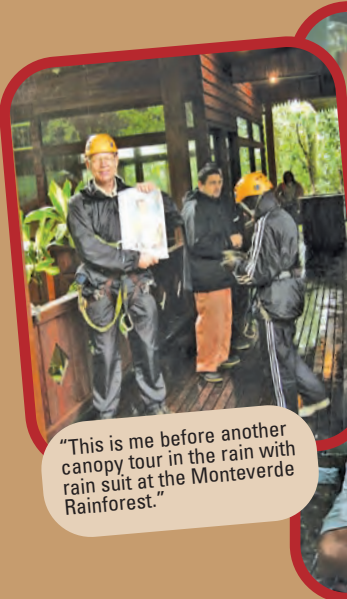
"This is me before another canopy tour in the rain with rain suit at the Monteverde Rainforest."