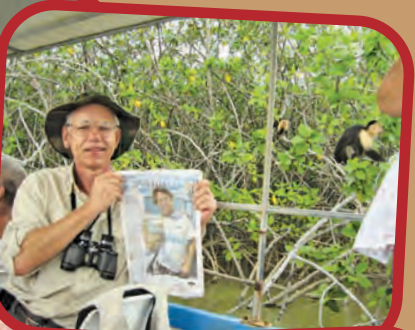
"This is with the White Face (organ grinder) monkeys at Isla Damas."