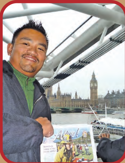
"Here are some photos from my trip in December to Paris, Rome and London." - Ehren Orlanes, Airport Police, Airports