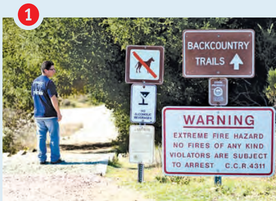
The trail starts right outside of the parking lot.