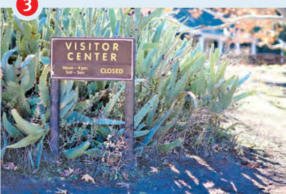
The visitor center hours.