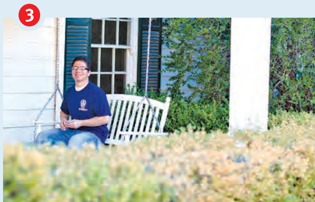
Taking it easy on the porch swing at the visitor center.