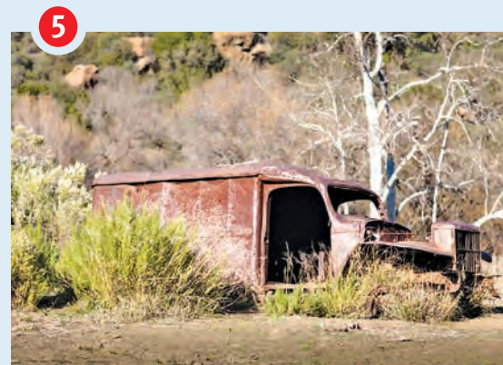
You're there! This is the old ambulance used as a prop in M*A*S*H.