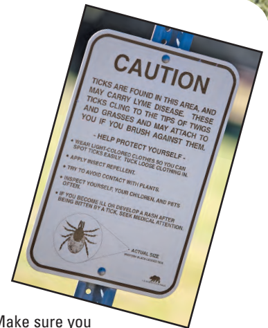
Make sure you always check for ticks after brushing against the grass or tree branches. And always take a tick removal tool with you!