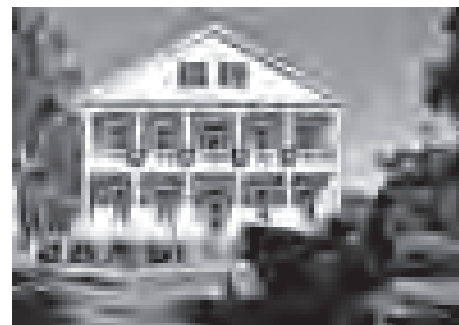
Banning Residence Museum offers visitors a Victorian Christmas experience.

The museum is a facility of Rec and Parks and is operated in cooperation with Friends of Banning Museum.