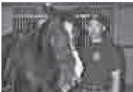
Nhut Huynh, PIII, with Boomer.