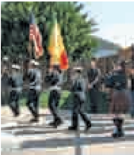
The Color Guard.