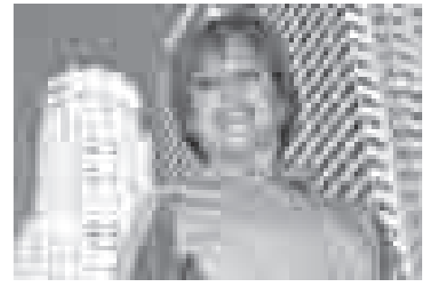
Olympic star Dorothy Hamill will help open the 11th season of L.A. Kings Downtown on Ice.

For more info and a detailed session schedule go to www.laparks.org or call (213) 847-4970.