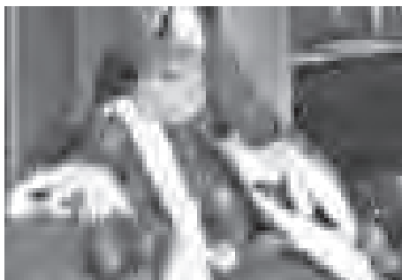
At last year's Santa's Hollywood Parade.

Santa's Holiday Parade extends to a full day with Winterfest street festival, which includes Disney star Demi Lovato.