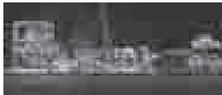
Last year at the DWP Light Festival.

■ Additional parking is available on the south side of the festival off of Los Feliz Boulevard. Guests can enter on Los Feliz Boulevard and Crystal Springs Drive. Parking is available at the Pony Ride, as well as the lots near the Merry-Go-Round. Visitors who park on the south side of the festival route will be able to